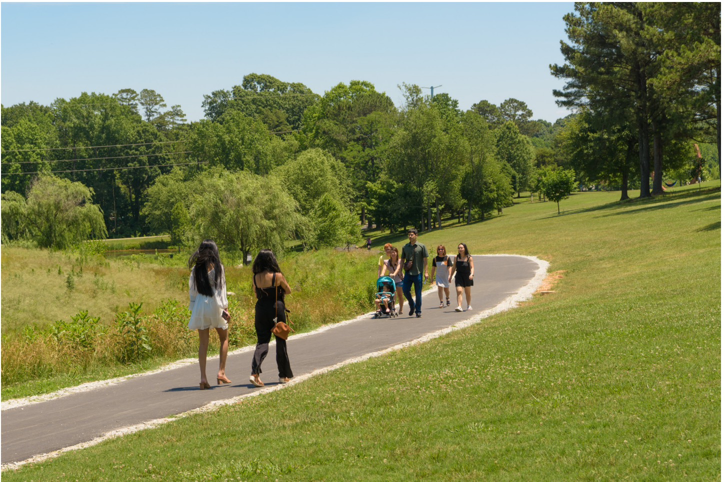
Image description: Two groups of people walk toward one another on a paved path surrounded by greenery.

1. Let's head to the Museum Park. The Park is over 164 acres and includes over 30 sculptures.