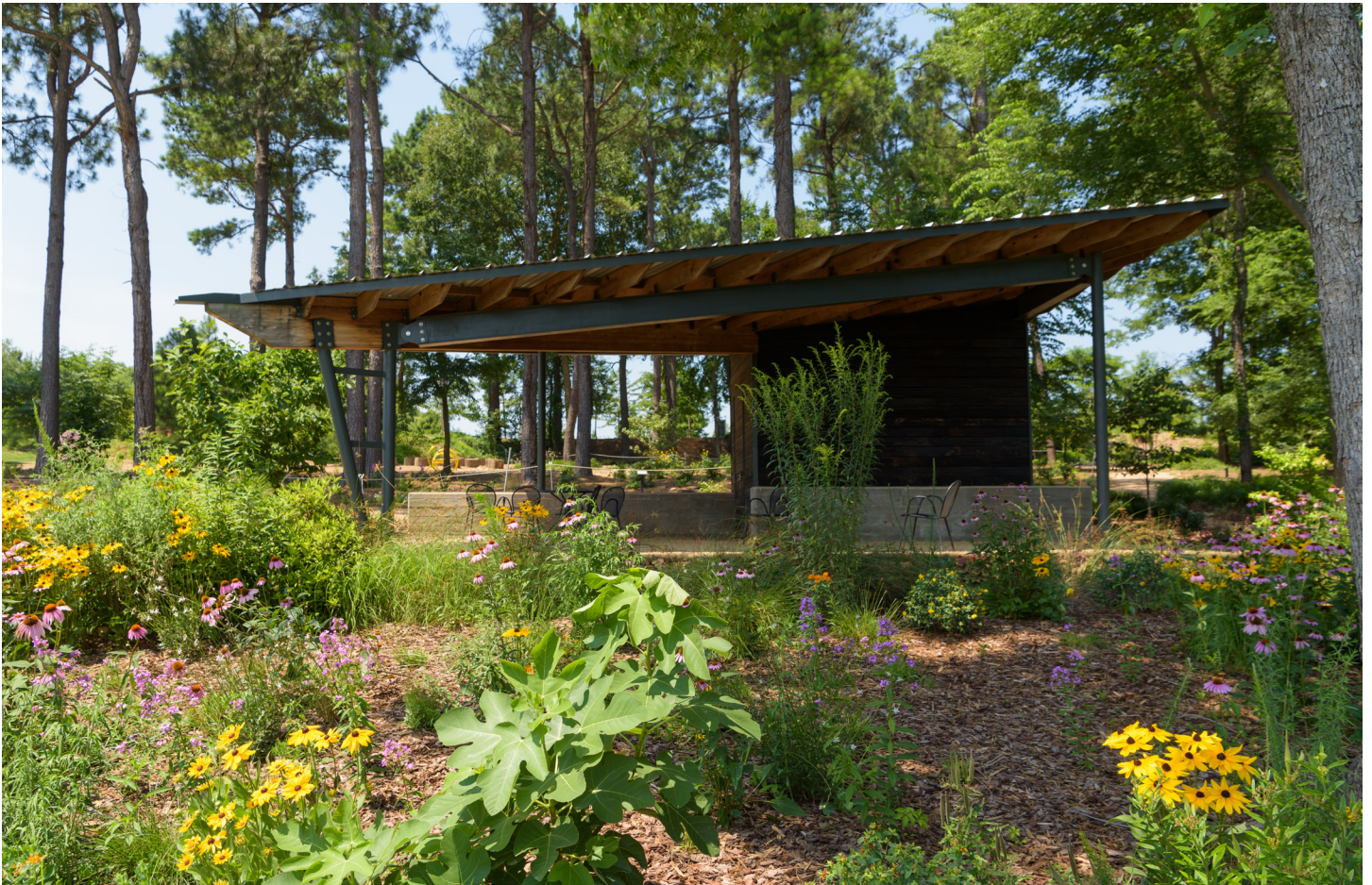
Image description: The Volunteer Garden shed has a slanted roof and overhang with seats underneath. It is surrounded by various green-leafed and flowering plants.

5. Now you can walk to the Volunteer Garden to look at the native plants and listen to the birds. Can you identify any of the flowers? Do you hear anything familiar?