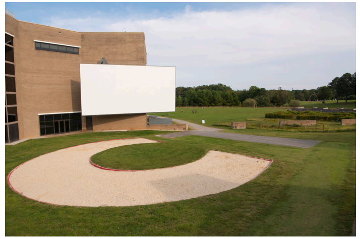
Image description (left): View of the Amphitheater stage from one of the far-end seats, which are arranged in a semicircle. The outdoor movie screen and East Building are in the background.

Image description (right): A large sandbox shaped as the letter C. The outdoor movie screen hangs above in the background attached to the facade of East Building.