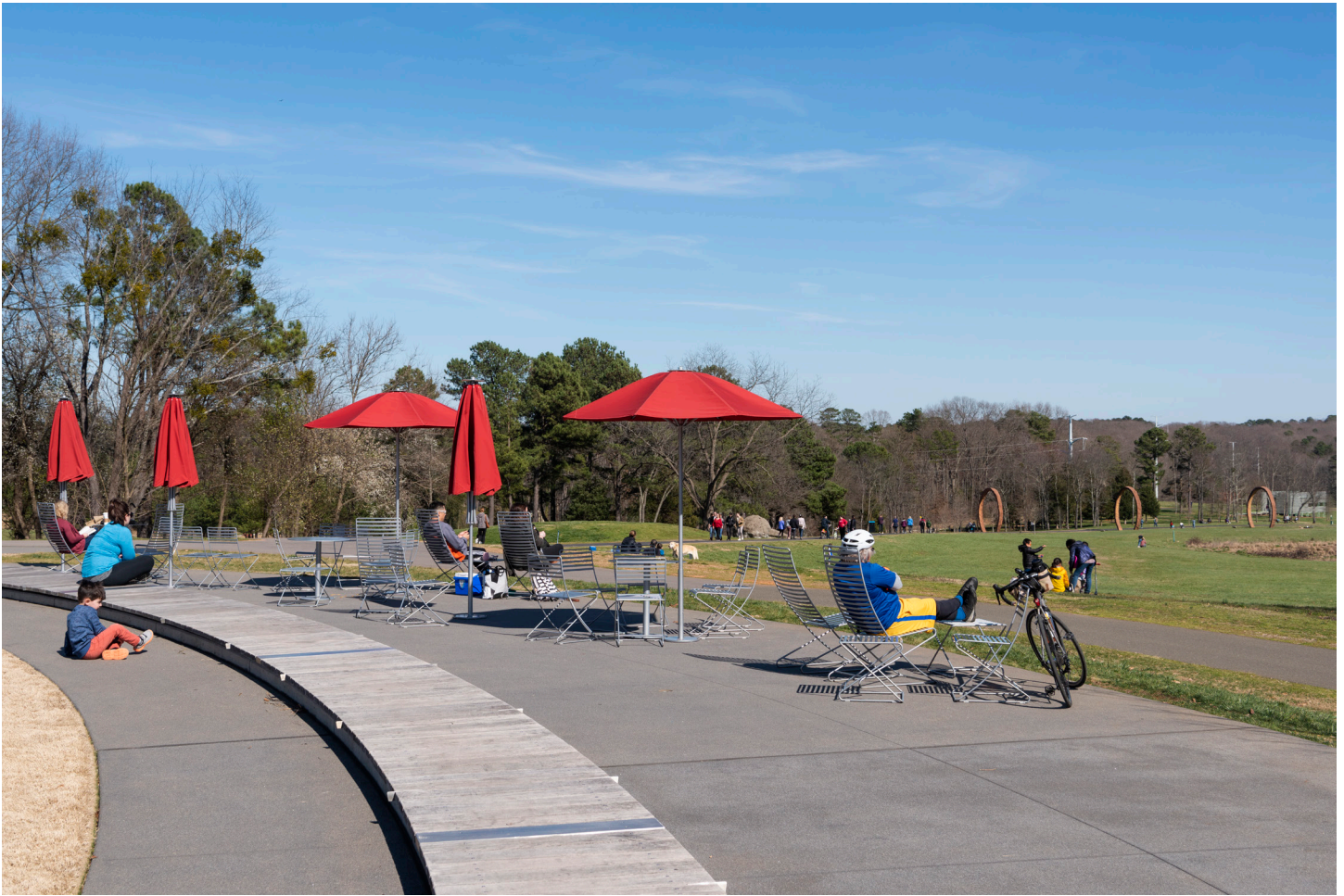
Image description: People sit on the ellipse-shaped path overlooking an open field area. There are tables with red umbrellas.

4. Next you can walk to the Ellipse and sit under the shade of a tree, on the grass, or on a chair underneath a red umbrella. Take a look at the grassy meadow. How many sculptures can you spot?