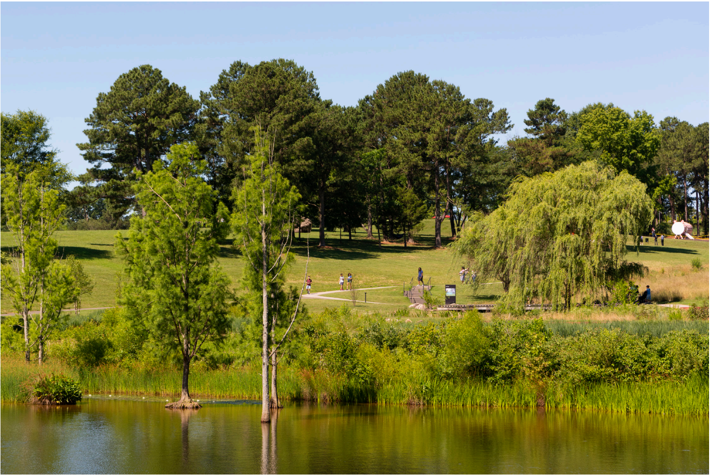
Image description: The pond appears in the foreground. Trees reflect in the water and are on the hill in the distance. Opposite the bank is a walking trail with people.

7. Another exciting area is the pond. If you wish, head that way. The pond and surrounding wetlands are home to native plants and animals such as turtles, frogs, and insects, like bees. Listen closely. What do you hear? Do you see any animals?