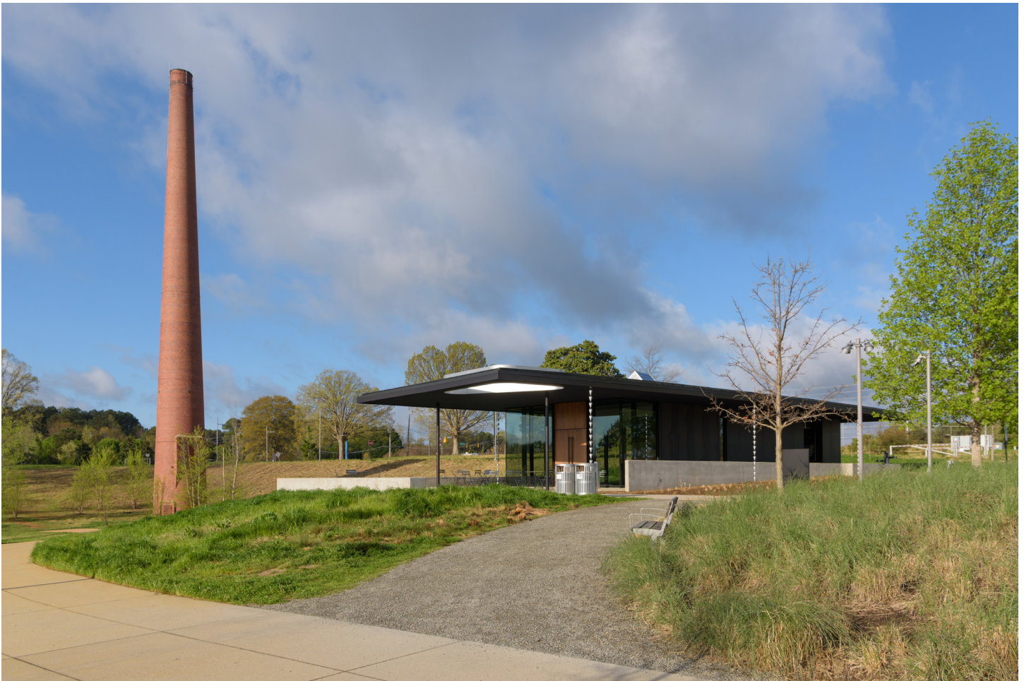
Image description: The Welcome Center is a black, one-story building with a covered patio and glass entrance. A tall, red brick smokestack is located to the left of the building.

9. Now you've explored the Museum Park. What does it look like to you? Complete the Welcome Center coloring page. We hope you had a great day at the NCMA!