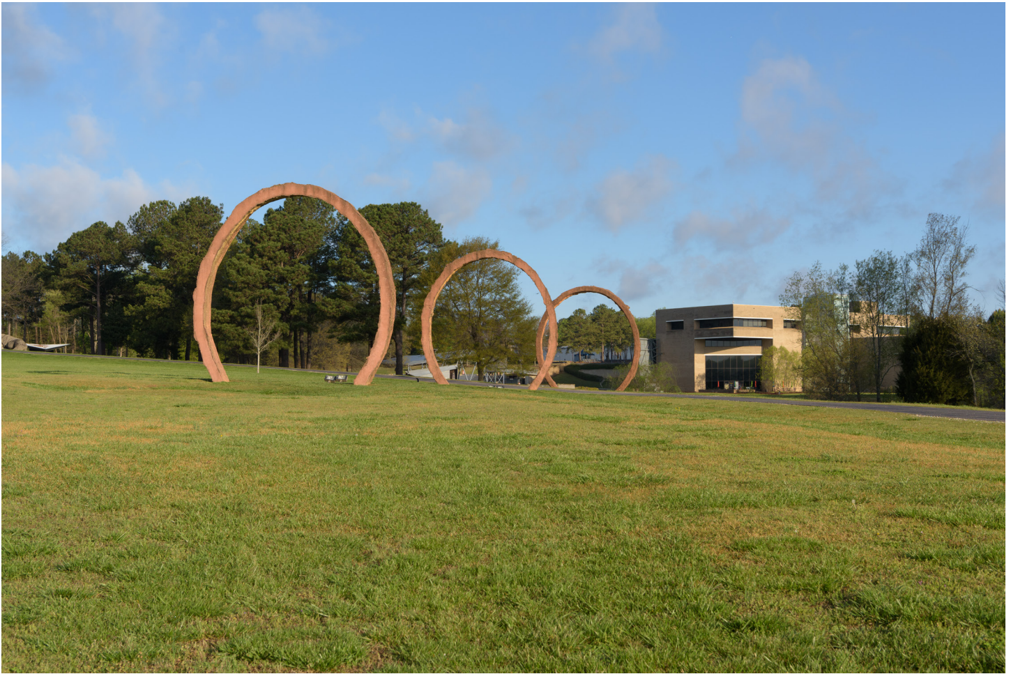
Image description: Thomas Sayre's Gyre , a large art installation made of three, rust colored rings, extends from the grassy earth. The rings are positioned one after the other receding into the distance toward a tree line and East Building.

8. If you have time, head up the hill to Thomas Sayre's Gyre , which is made of three large rings that cross the Blue Loop trail. Walk through the three rings. Do you feel like you are in a spiral? How do they appear to you? Complete the Gyre coloring page.