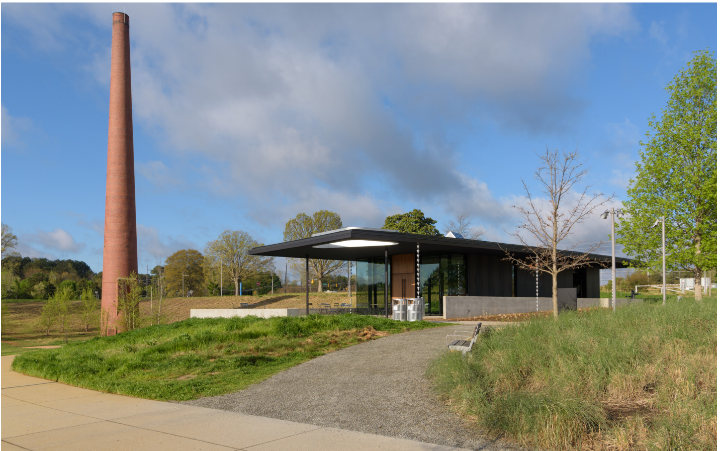
Image description: The Welcome Center is a black, one-story building with a covered patio and glass entrance. A tall, red brick smokestack is located to the left of the building.