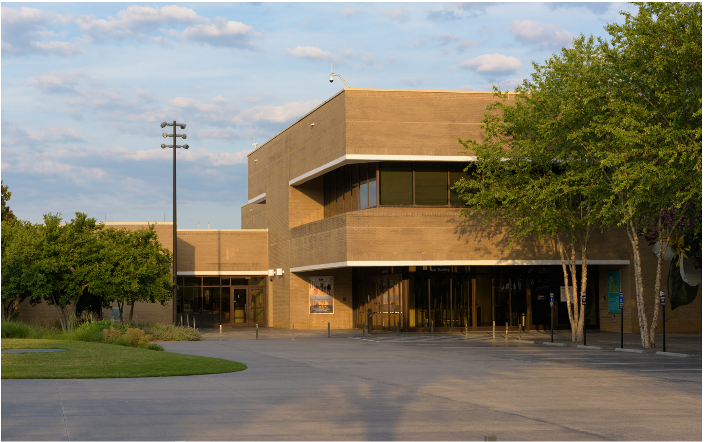
Image description: A large paved pathway lined with trees leads to East Building, a multistory, tan, brick building.

9. Now you've explored East Building. What does it look like to you? Complete the East Building coloring page.