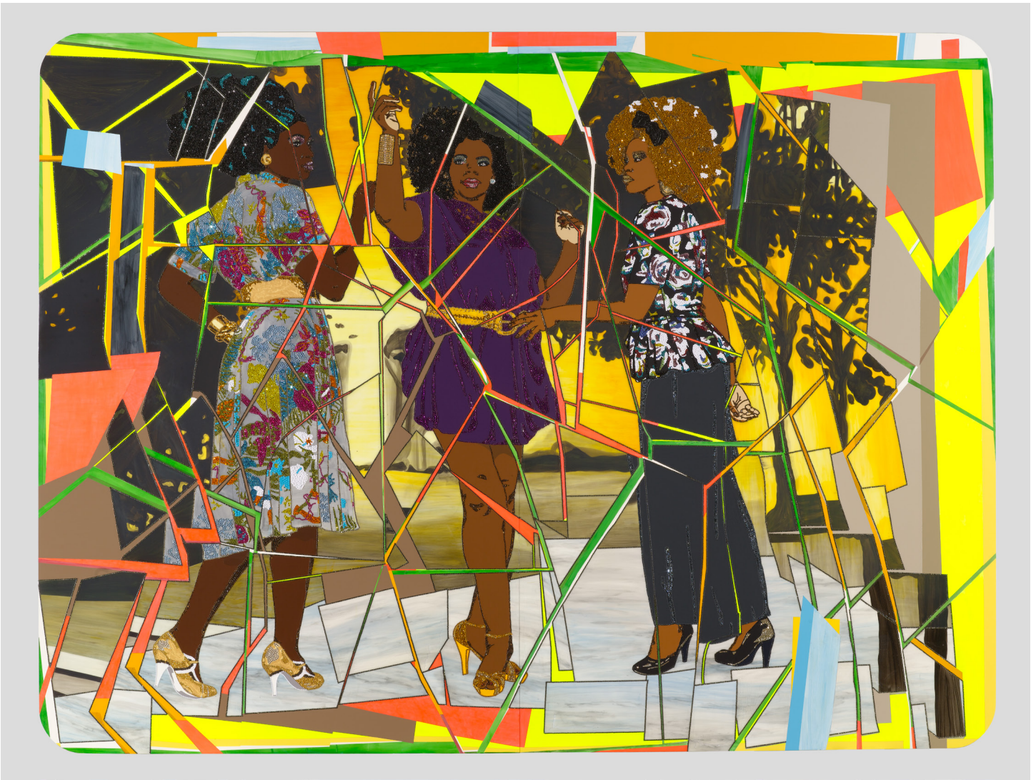
Image description: A large mixed-media painting of three Black women dressed in 1970s-inspired clothing. They stand next to one another in various poses that emulate the “Three Graces” from classical antiquity. The surface is fragmented; geometric, neon lines break the image into irregular shapes similar to broken glass.

5. Find Mickalene Thomas’s Three Graces: Les Trois Femmes Noires in the “Portraits and Power” gallery. Notice all the various colors and textures. What stands out to you? Complete the Three Graces coloring page.