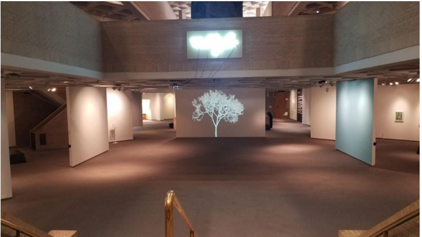
Image description: From the steps that lead down to Level B, there is a view of the open floor plan. It includes three gallery spaces and the current video installation in the middle.

6. On Level B you can find the photo and video galleries, Gallery 1 (Meymandi Exhibition Gallery), Gallery 2 (Pope Gallery), and Gallery 3. Can you find the video installation? What do you enjoy about it?