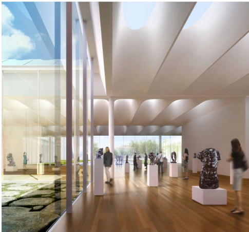
Rendering of the Rodin Court.

The two Museum buildings are located on a campus of softly rolling hills edged by native woods. Major works of sculpture and artist-conceived environmental projects are sited throughout this landscape, which also includes an outdoor amphitheater created in collaboration with artist Barbara Kruger, as well as trails for walking and biking.