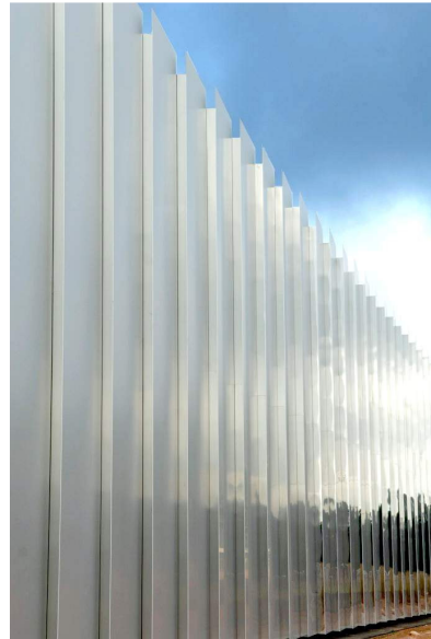
New building, detail.

All together, there are five such courtyards, each of which seems to enter the building, breaching the perimeter of what would otherwise be a rectangular structure. All are visible through glass walls, and all but one are accessible directly from the sculpture hall, as well as from the outdoors. In addition to the Rodin courtyard, these include a landscaped